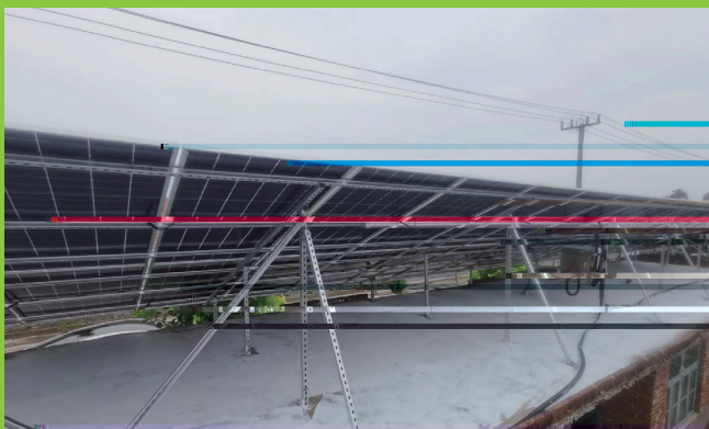
Figure 2. The project picture

In total, 30 pieces of bifacial modules of two different technologies TOPCon and PERC were installed in two fixed arrays at a tilt angle of 25°, and each bifacial module contains 144 pieces of the half-cut cell (182" size). Moreover, the height of the supporting system was 0.4 meter. The ground was painted white to acquire accurate results since bifacial modules are sensitive to the surroundings. The PASAN Sun simulator measured the front and rear sides' electrical characteristics. The bifaciality and the low light efficiency at 200W/m 2 were also measured and calculated. The outdoor energy generation was measured by GCI-36K-5G inverter in a 5-min interval. The energy yield performance of TOPCon, and PERC bifacial PV were revealed and systematically compared.